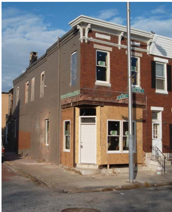
TYPICAL HOUSE PRIOR TO RENOVATION