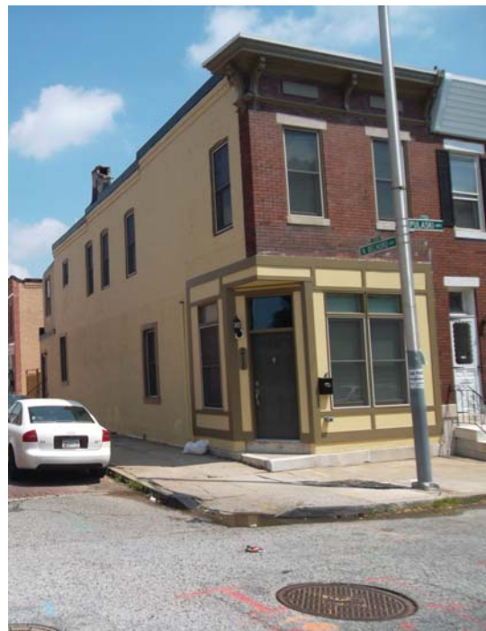
RENOVATED HOUSE BASED ON THE GREEN BUILDING TEMPLATE